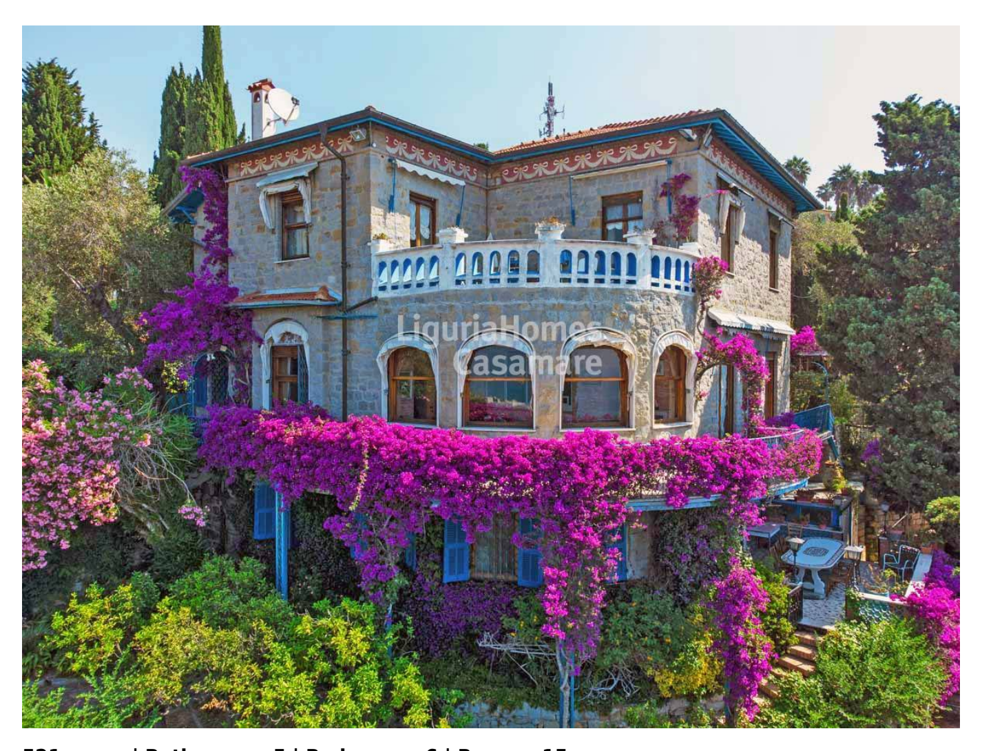
521 sq.m. | Bathrooms: 5 | Bedrooms: 6 | Rooms: 15

Bordighera Charming period villa for sale.