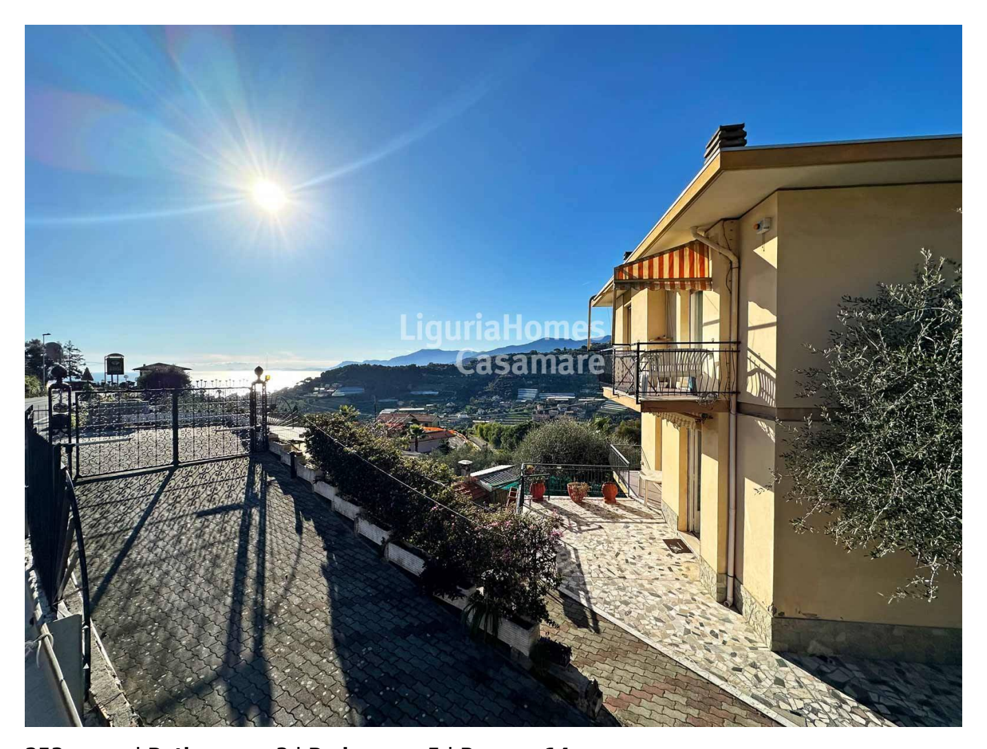
253 sq.m. | Bathrooms: 3 | Bedrooms: 5 | Rooms: 14

Large multi-family villa for sale with sea view in Bordighera.